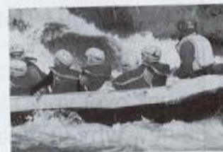
Rafting down the river

We all have responsibilities around camp too, with each team taking it in turns to cook for everyone. We'll even teach you how to build the campfires! There's also plenty of time and space to just kick back and relax — this is a holiday, after all.