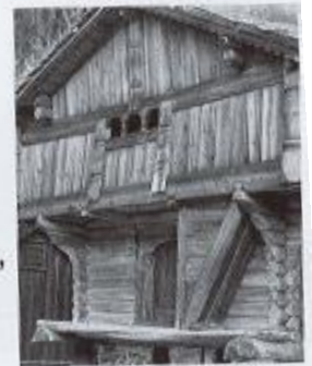
One of our log cabins

Fierce Forest is a summer camp that runs in the school holidays. Our fantastic woodland site is fully equipped for the ultimate summer adventure: awesome log cabins, an amazing array of activities and expert camp leaders who will look after you and teach you the ways of the wild. Additionally, everyone at Fierce Forest is a member of one of our four teams: Firecrests, Warblers, Blackcaps and Sparrowhawks. Win points for your team to earn rewards, such as an afternoon treetop exploring or extra marshmallow rations for those all-important campfire sessions.